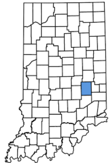
Figure 1: Rush County - Blue

The County recognizes that ISPs must make a profit in their proposed networks. However, the county clearly recognizes that there is a vast difference between availability and affordability. To this end, the proposal should ensure that the minimum offering will meet the 25/3 requirements and will be affordable to the vast majority of citizens. At a conceptual level, the minimum standard of service should probably be in the $65/month range.